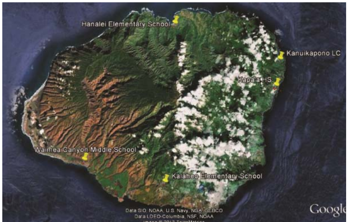
Figure 3. Map of air sampling sites on Kauai Waimea Canyon Middle School Kalaheo Elementary School Hanalei Elementary School Kanuikapono Learning Center Kapaa High School