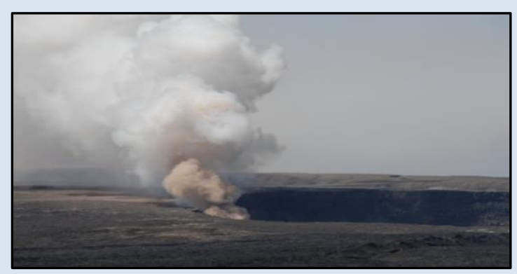
For more information on the Clean Air Branch visit: <u>http://health.hawaii.gov/cab</u>