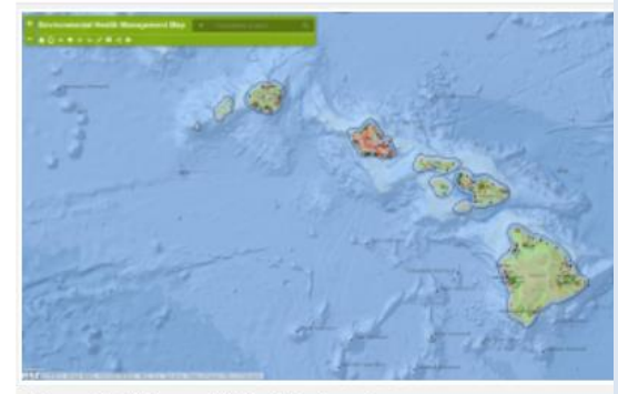
Environmental Health Management Web App. Click on the map above.

EGIS coordinates and provides much of the Department's Environmental GIS.